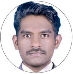
ALPHIN BABY Lulu International