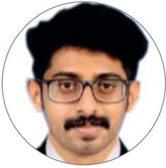
SOURAV C Big Basket, A TATA Enterprise